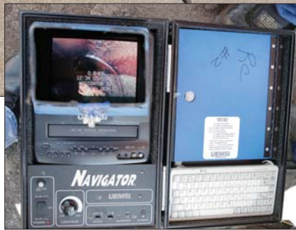
The light-colored object in the bottom center of the screen is a root that has entered a sewer line. RootX will be used to kill the root.

(SSOs) caused by root intrusion on a more preventative basis. Protecting the environment and community is priority one for the agency: because of its relatively small land mass, everyone is affected.